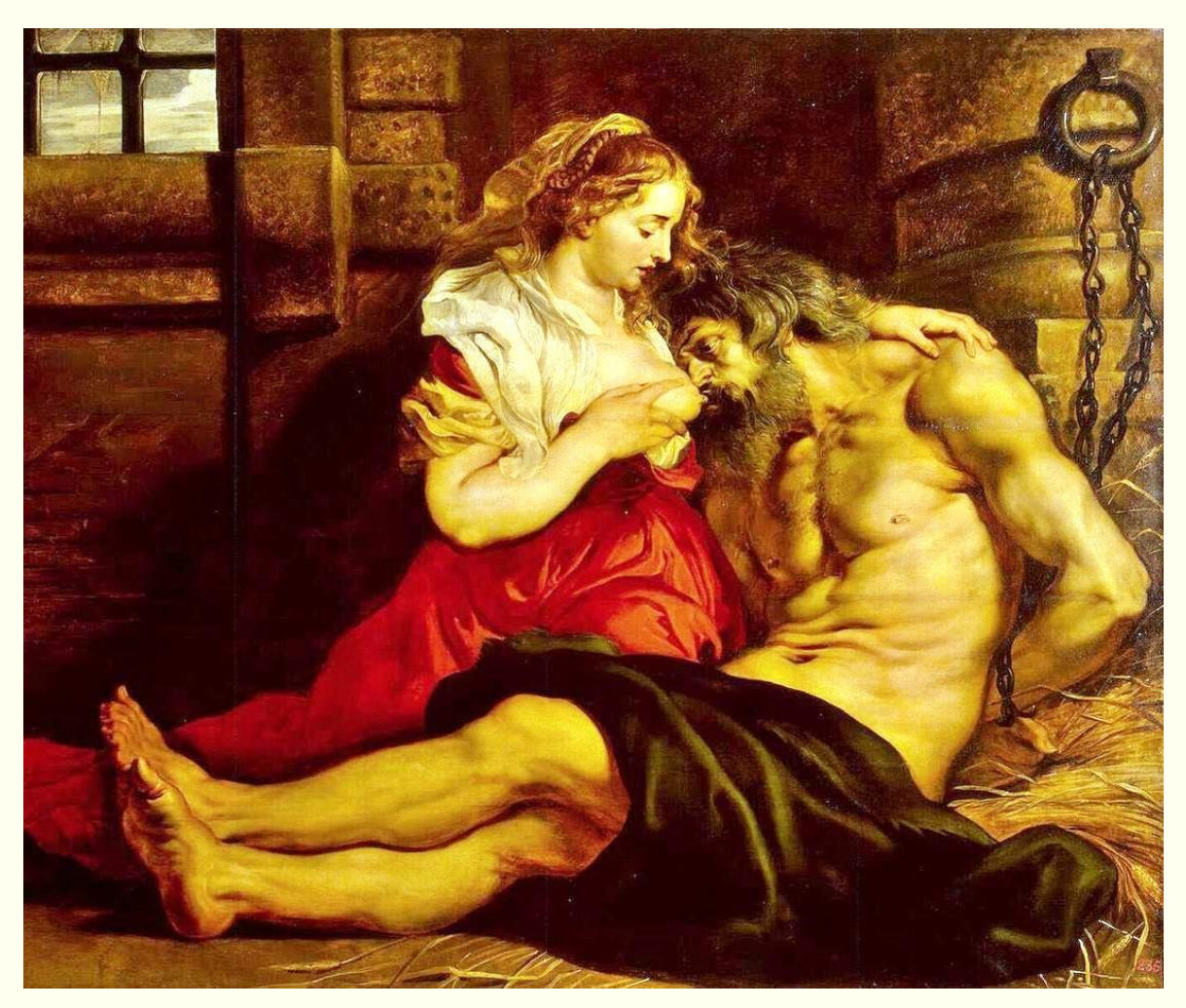
Roman Charity (1610) Pieter Pauwel Rubens, Hermitage<sup>1</sup>