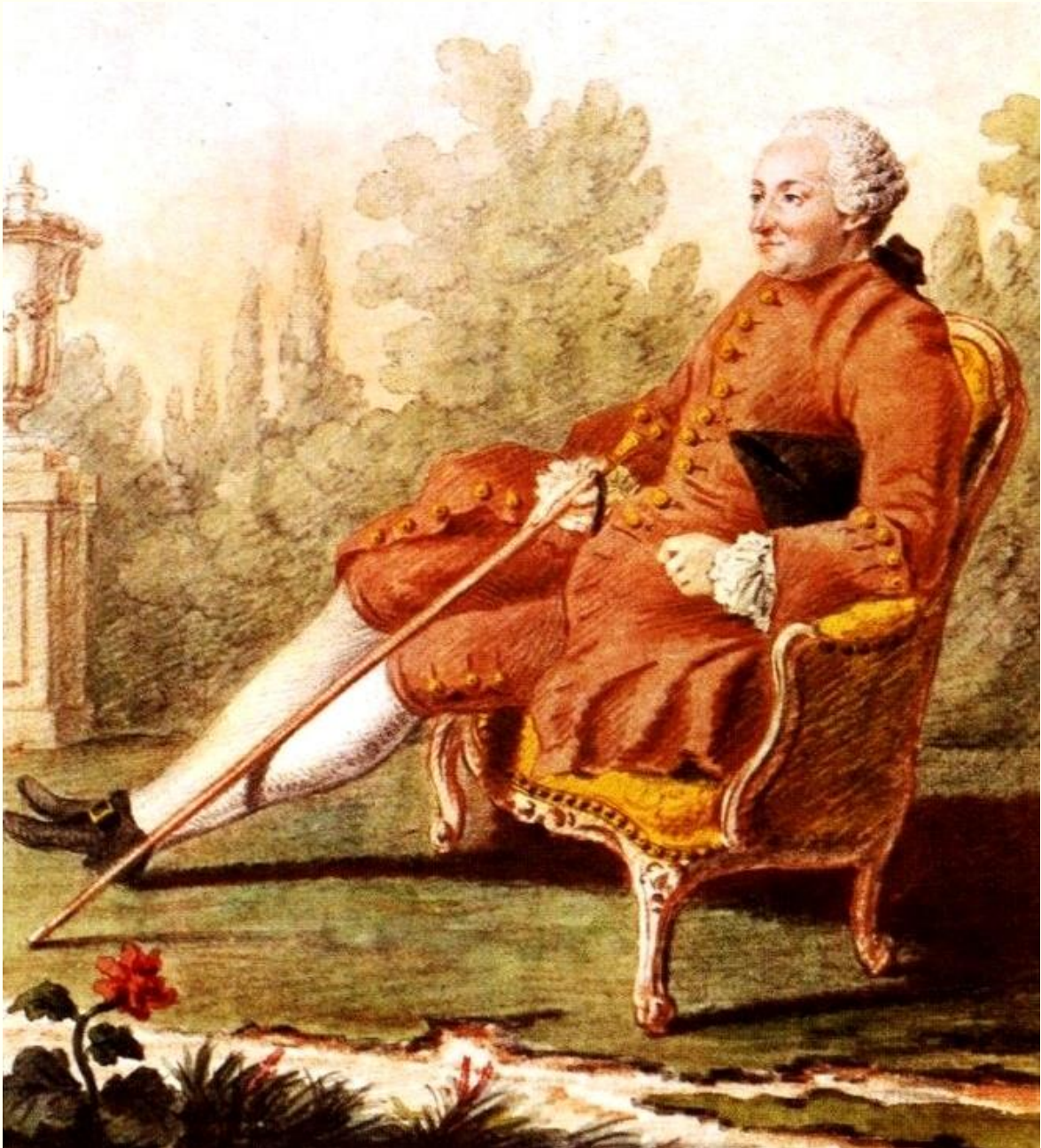
Baron d'Holbach (1766) Louis Carmontelle, Chantilly, Musée Condé

In fine twelfthly, that matter is the principle of motion, which it contains within itself, since matter only is capable of giving and receiving motion: this is what cannot be conceived of an immaterial and simple being, destitute of parts; who, devoid of extent, of mass, of weight, cannot either move himself, or move other bodies much less, create, produce, and preserve them. 1