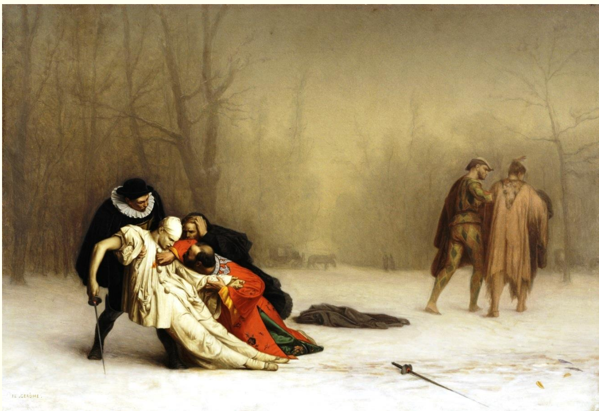
The duel after the masquerade (1857) Jean-Léon Gérôme, Walters Art Museum