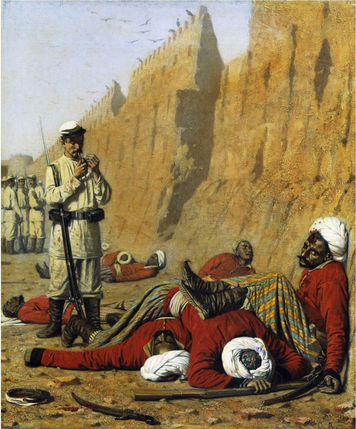
After Failure (1868) Vasily Vereshchagin, State Russian Museum, St. Petersburg