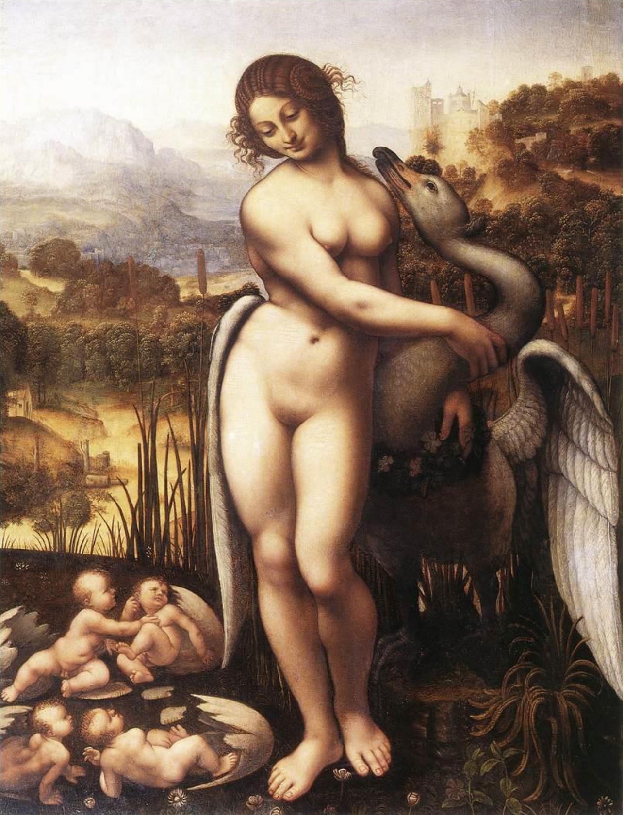
Leda and the Swan (oil on panel, 695 x 737 mm) by Leonardo da Vinci Earls of Pembroke, Wilton House, Salisbury, England