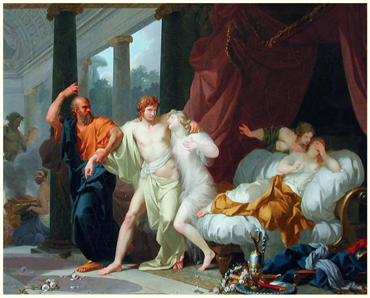
Socrates dragging Alcibiades from the embrace of sensual pleasure (1791) Jean-Baptiste Regnault

ades has risen superior to the multitude of lovers, for on account of his arrogance in their regard he scorned their discordant and disorderly importunity; but as regards the making of provision and the movements within the soul he is overcome by Socrates, since by their means he is persuaded by him that he (Socrates) is "more than anything else worthy" of his earnest attention. Herein is demonstrated how great is the superiority of the inspired over the common lover. The latter is deficient even in the advantages of nature; but these are secondary to movements of the soul; and the latter are perfected only by the inspired lover. "Much more, then," the geometers would say, would vulgar love be said to be inferior to divine.