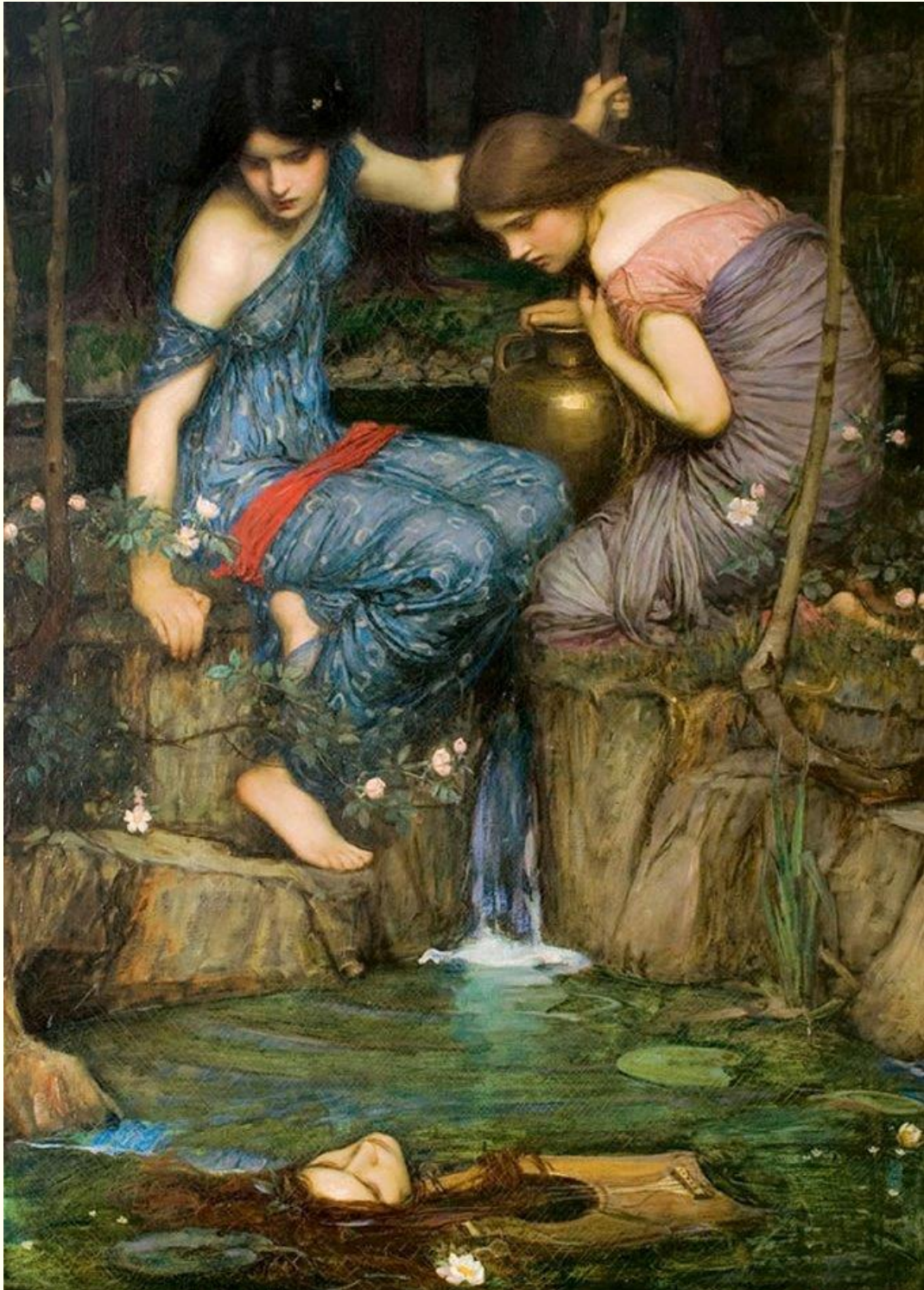
Nymphs finding the head of Orpheus (1900) John William Waterhouse

The ancient philosophy has been for many years the only study of his retired leisure; in which he has found an inexhaustible treasure of intellectual wealth, and a perpetual fountain of wisdom and delight. Presuming that such a pursuit must greatly advantage the present undertaking, and feeling the most sovereign contempt for the sordid drudgery of hired composition, he desires no other reward, if he has succeeded, than the praise of the liberal; and no other defence if he has failed, than the decision of the candid, and discerning few.