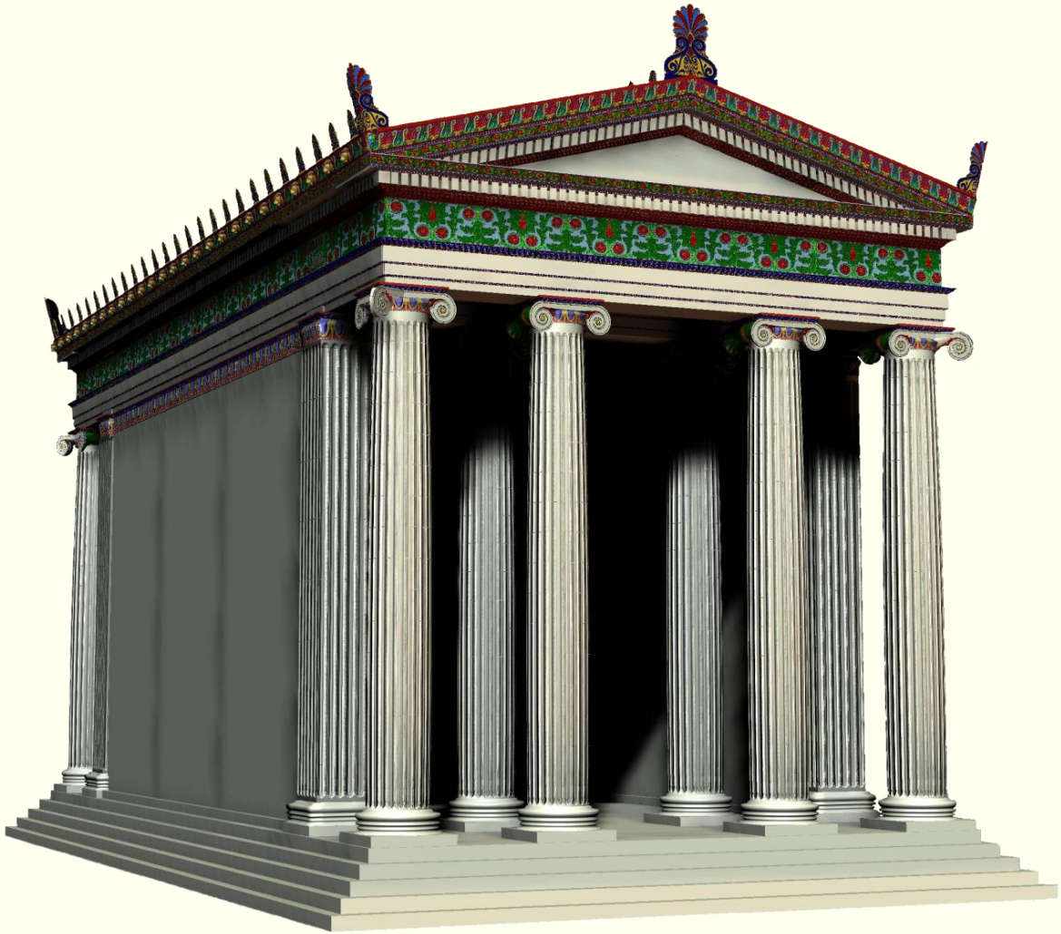
Ancient Greek tetrastyle portico under a triangular roof 1 Temple of Saptaparna, 2 the Heavenly Man, and His glorious destiny.