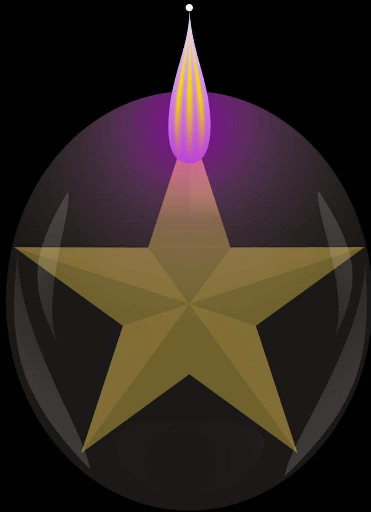
Aura of the Yogi in Samadhi