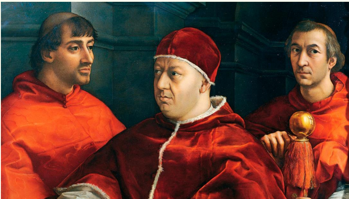
Pope Leo X, the cynical author of the ever famous sentence: "How useful to us this fable of Christ." 1

Who, after reading the above, would dare to deny that the coming of Christ was a gigantic failure, and the claims of his Church and followers as gigantic a sham? A wretched chance the poor Theosophists would have if they should be cast upon some island where this theocratic Boanerges enjoyed absolute power!