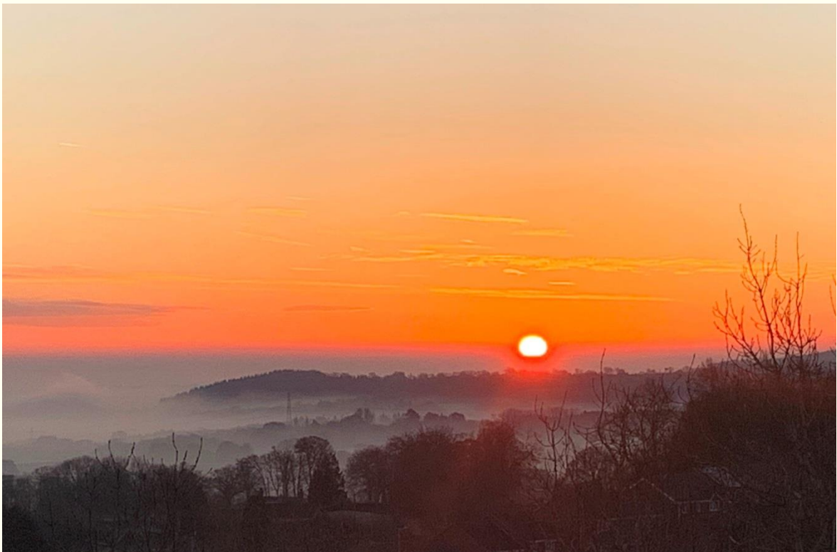
Sunrise in Gwernymynydd, North Wales (14 February 2023)