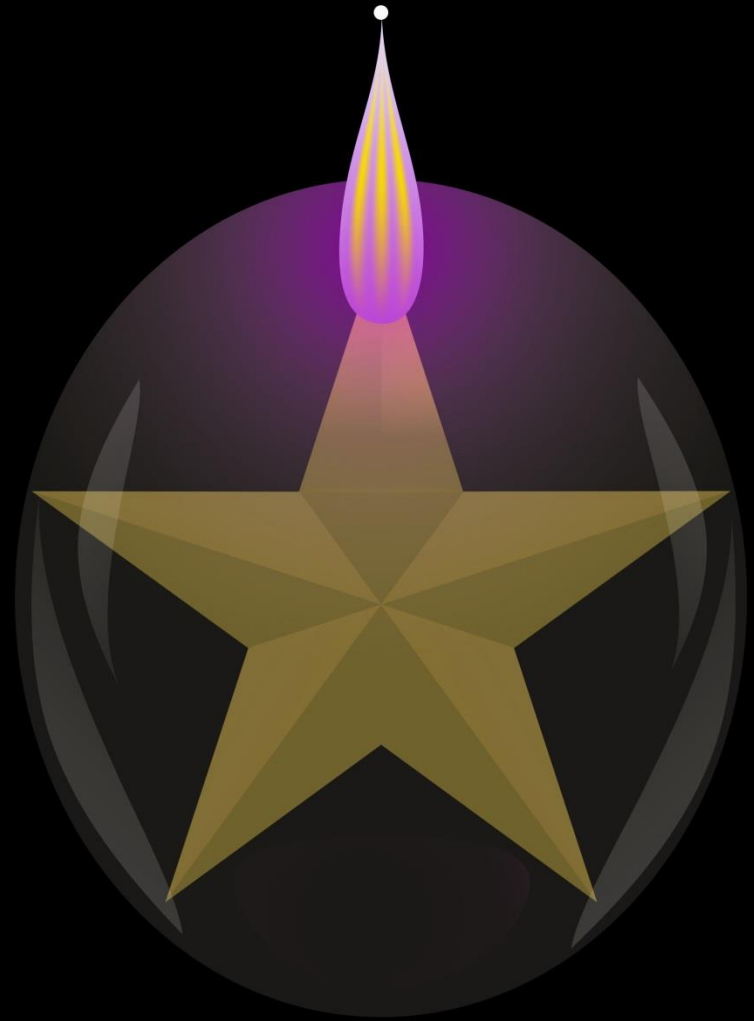
Aura of the Yogi in Samadhi