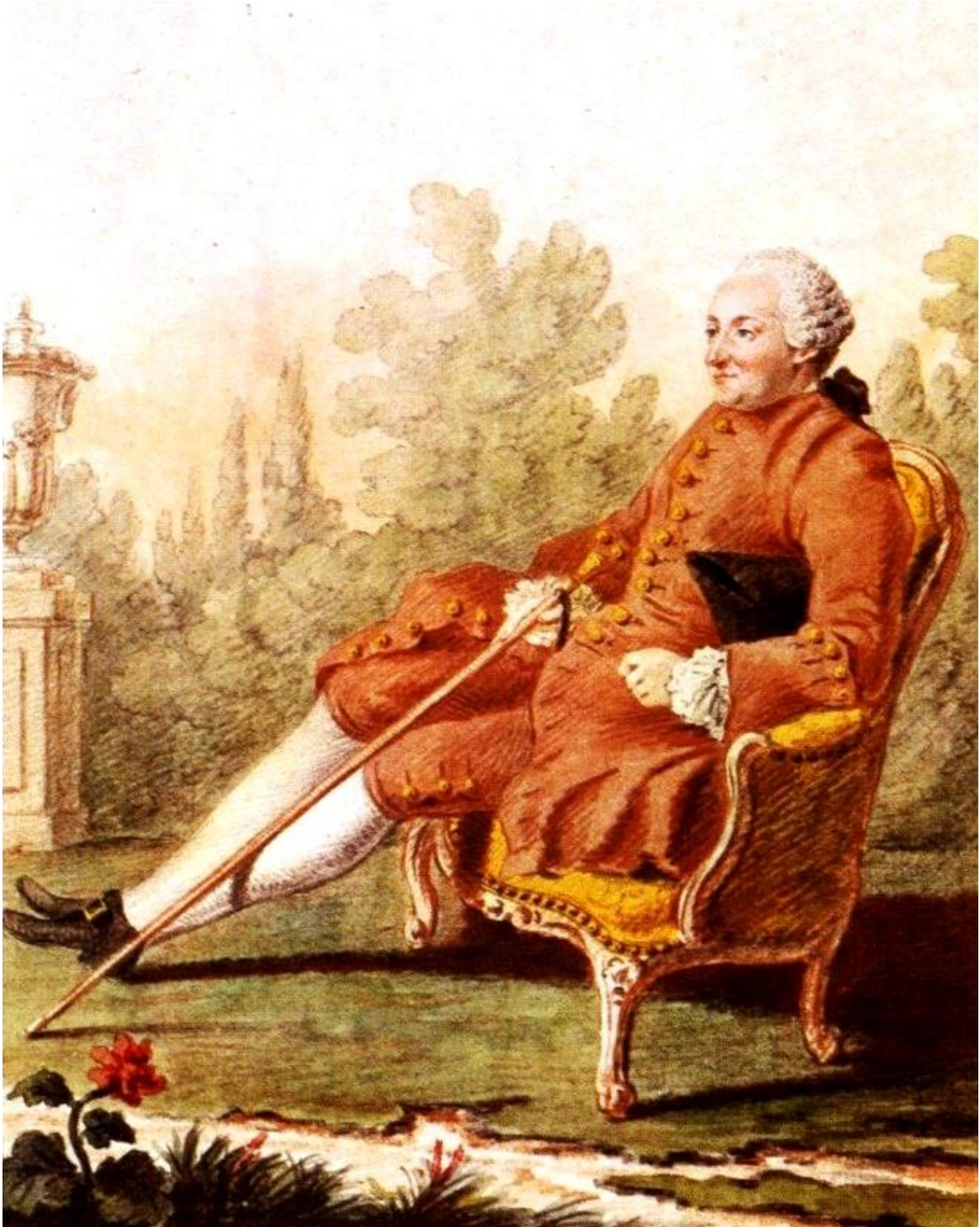
Baron d'Holbach (1766) Louis Carmontelle, Chantilly, Musée Condé

In fine twelfthly, that matter is the principle of motion, which it contains within itself, since matter only is capable of giving and receiving motion: this is what cannot be conceived of an immaterial and simple being, destitute of parts; who, devoid of extent, of mass, of weight, cannot either move himself, or move other bodies much less, create, produce, and preserve them. 1