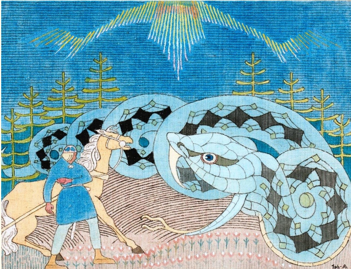
Lemminkäinen and the Great Snake (1919-20) Joseph Alanen

We regret that lack of space prevents us from quoting the suggestive Rune of Väinämöinen's seven-fold sowing, where each crop springs up after a conflagration and strewing of ashes — the periodical dissolutions and reconstructions of the universe always completed in seven. The Runes of the "Origin of Iron," the "Finding of the Lost-word," the "Origin of the Serpent," and the "Restoration of the Sun and Moon," are also full of Occultism; but for these we must refer readers to Mr Crawford's admirable translation.