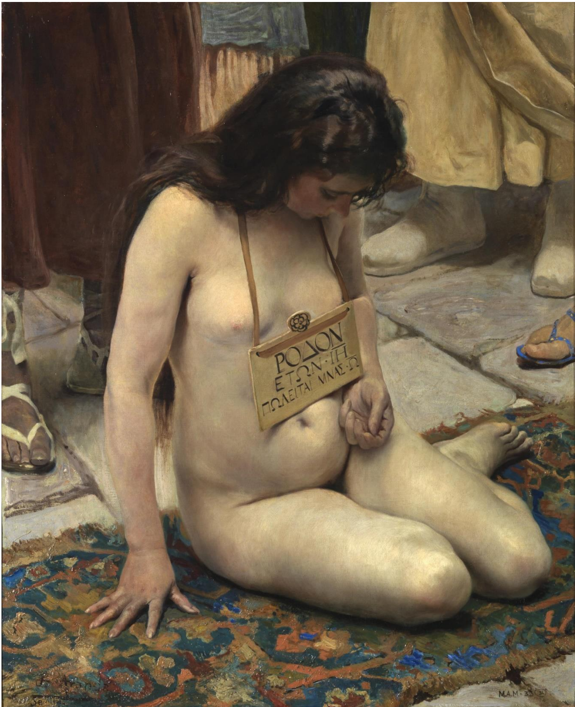
Una esclava en venta (c. 1897) José Jiménez Aranda, Museo de Málaga *

The materialism of today is born of the brutal yesterday