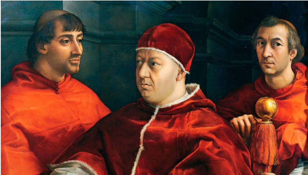
Pope Leo X, the cynical author of the ever famous sentence: "How useful to us this fable of Christ." 1

Who, after reading the above, would dare to deny that the coming of Christ was a gigantic failure, and the claims of his Church and followers as gigantic a sham? A wretched chance the poor Theosophists would have if they should be cast upon some island where this theocratic Boanerges enjoyed absolute power!