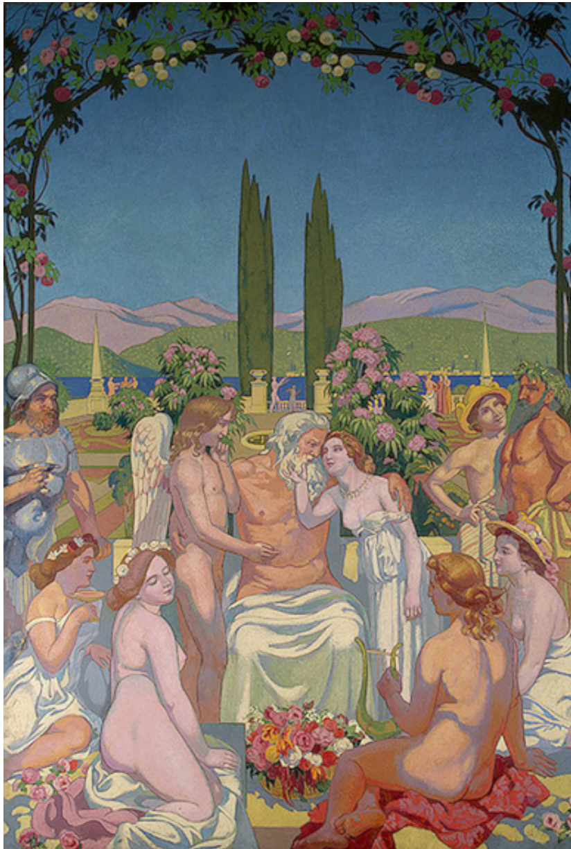
In the presence of the Gods, Jupiter grants Psyche immortality and celebrates her marriage with Cupid - Panel 5 (1908) Maurice Denis, Hermitage

the warring sects of Christendom, as with other great religions, orthodoxy is considered essential. There are said to be over three hundred “sects” in Protestant England alone. If England has progressed that far toward personal liberty, the logic of events and the philosophy of history may easily forecast the future, and allow every man and woman to constitute a “sect” and the only loser will then be the organized power of the priesthood and Religious Establishment. The gainer will be Humanity. Then only will it be understood and everywhere admitted, that the human soul is the real temple of the Most High; and the indwelling of the Holy Ghost will inspire the life of the soul of man. The “saving ordinances” will be altruistic life of every man and woman. Theosophy, therefore, means more Christianity and less orthodoxy; more altruism, more liberty, and less ceremony; more genuine worship of the Simple Truth, and fewer shams.