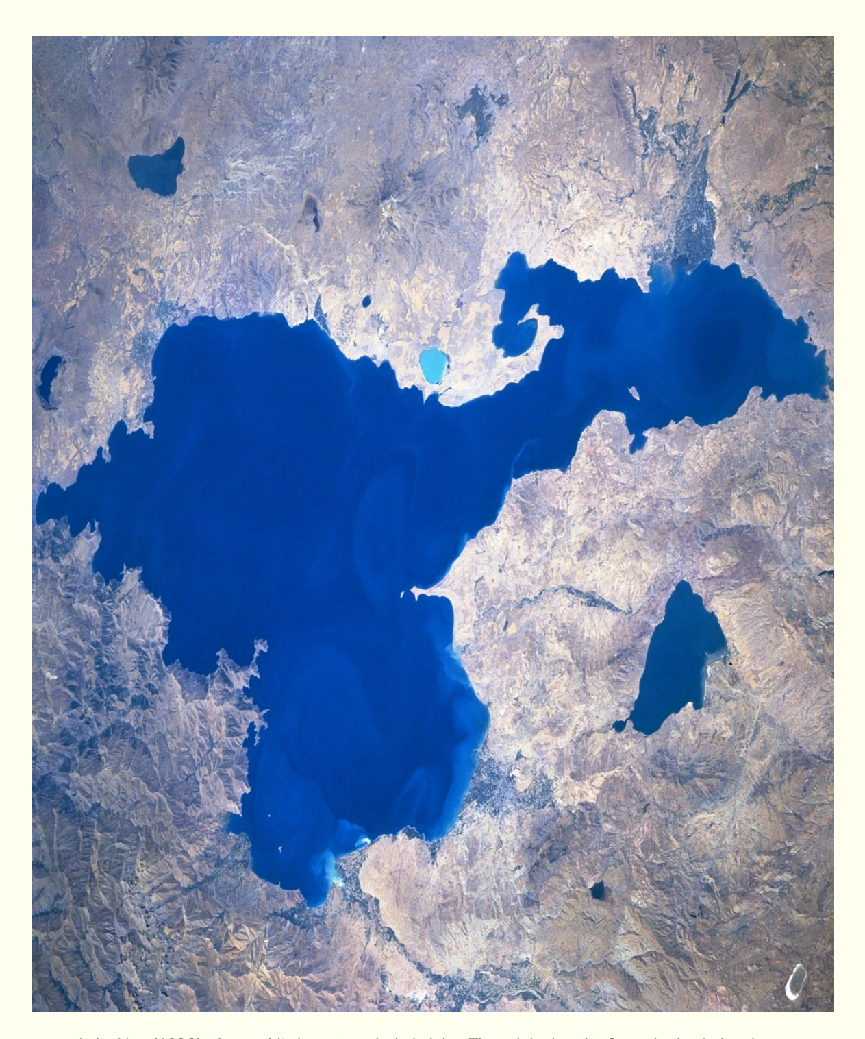
Lake Van (1996), the world's largest endorheic lake. The original outlet from the basin has been blocked by an ancient volcanic eruption. Altitude 1,640 m. Coordinates 38^{\circ} 38' N - 42^{\circ} 49' E .