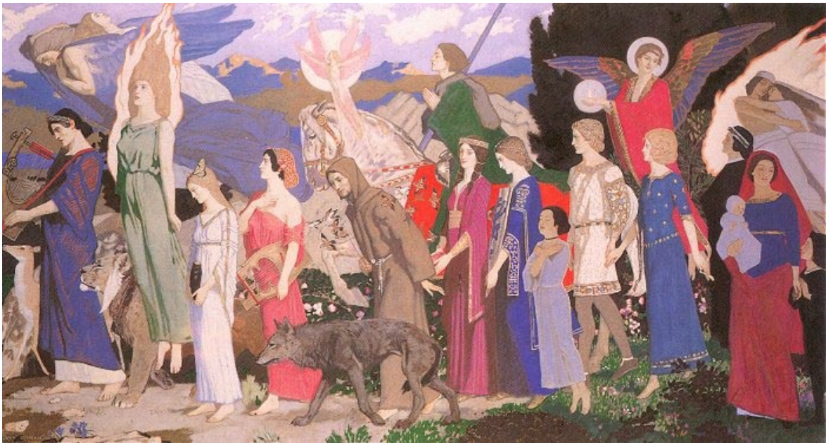
Masque of Love (1921) John Duncan Renfrew District Council Museum and Art Gallery, Paisley, Scotland

“The leading figure in the procession shown in this painting, holding a lyre, is Orpheus. He is followed by the goddess Semele, who, tricked by the jealous Hera, demanded that her divine lover Zeus, the god of lightning, appear before her in his true form, whereupon she was consumed by fire. Behind Semele are Psyche and Cupid, and Sappho, the poet of Lesbos. Sappho is followed by Francis of Assisi, a monk who communicated with animals. Following St Francis is Iseult, carrying the cup from which she and Tristan will drink. Next is Elaine (from Arthurian legend), who carries the shield of Lancelot, who spurns her love causing her to die of her grief. Following her is Hugh of Lincoln, the boy saint who died at the age of nine in 1255. Next come Aucassin and Nicolette, two lovers from 12 th century French tales. Behind them is the poet Dante and above him his vision of Paolo and Francesco. Finally, Magia Santi completes the procession, holding the hand of her son Raphael who, with Michelangelo and Leonardo, was the youngest of the creators of the High Renaissance. In the background Alcestis is carried off to death (behind Semele), and Percival carries a stave as he rides in quest of the Holy Grail.” — http://www.rastko.org.yu/drama/zstefanovic/orfej/mit/