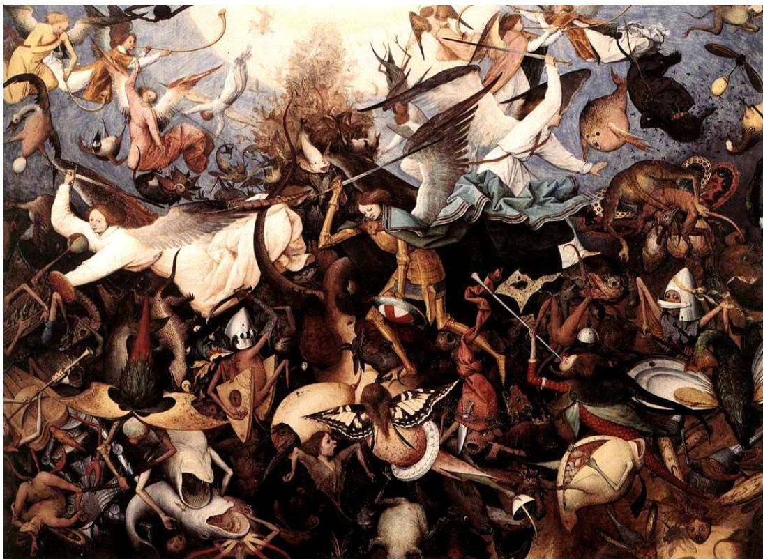
The Fall of the Rebel Angels (1562) Pieter Bruegel the Elder, Brussels