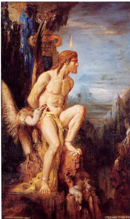
Prometheus Bound (1868) Gustave Moreau

In our modern day there does not exist the slightest doubt in the minds of the best European symbolologists that the name Prometheus possessed the greatest and most mysterious significance in antiquity. While giving the history of Deukalion, whom the Bœotians regarded as the ancestor of the human races, and who was the Son of Prometheus, according to the significant legend, the author of the Mythologie de la Grèce Antique remarks: