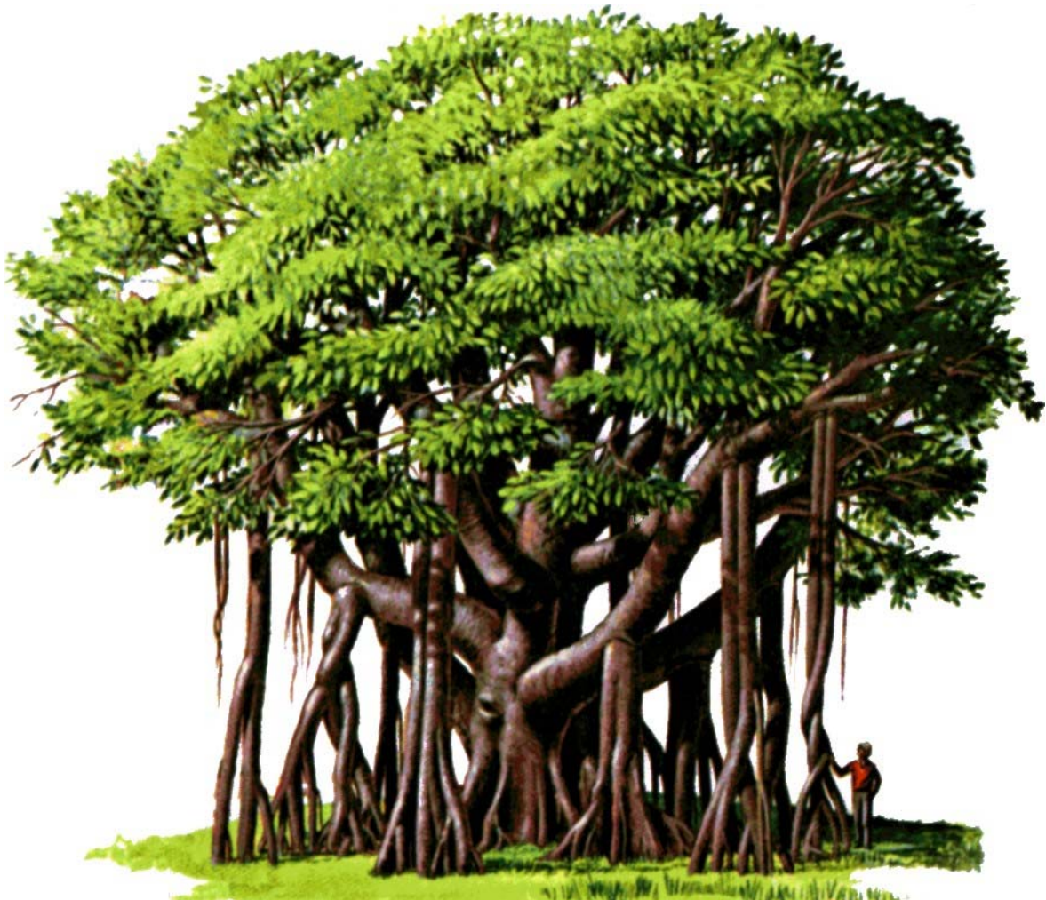
Arasa-Maram, “the ever-living-human-Banyan,” symbol of the Arhats of the “Fire-Mist” Cf. Secret Doctrine, I p. 207

Thus “SATAN,” once he ceases to be viewed in the superstitious, dogmatic, unphilosophical spirit of the Churches, grows into the grandiose image of one who made of terrestrial a divine MAN; who gave him, throughout the long cycle of Mahā-kalpa the law of the Spirit of Life, and made him free from the Sin of Ignorance, hence of death. 51