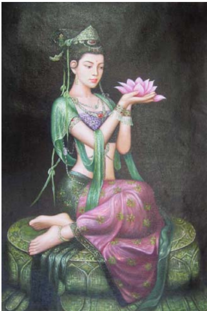
Kuan Yin, Goddess of Mercy

Esoterically speaking, they are Nirmanakayas. Having been liberated from the doom of continual rebirths in past kalpas, they have been incarnating voluntarily in the first four Rounds and Races of this Manvantara for the good of mankind.