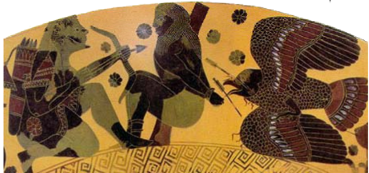
Hercules liberating Prometheus, Attican wine krater c 610 BCE, Athens