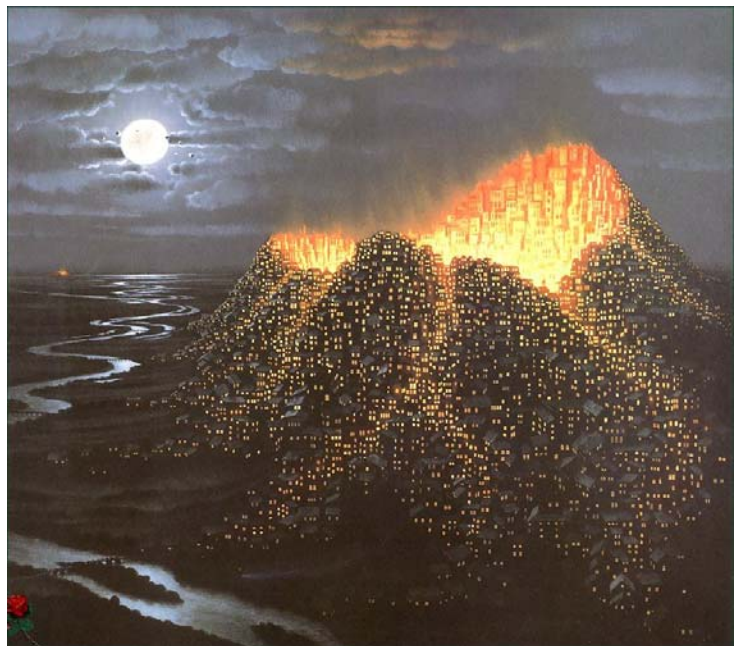
Eruption by Jacek Yerka

When incarnating, and in other cases only informing the human vehicles evolved by the first brainless ( manasless ) race, the incarnating Powers and Principles had to make their choice between, and take into account, the past Karmas of the Monads , between which and their bodies they had to become the connecting link. 27