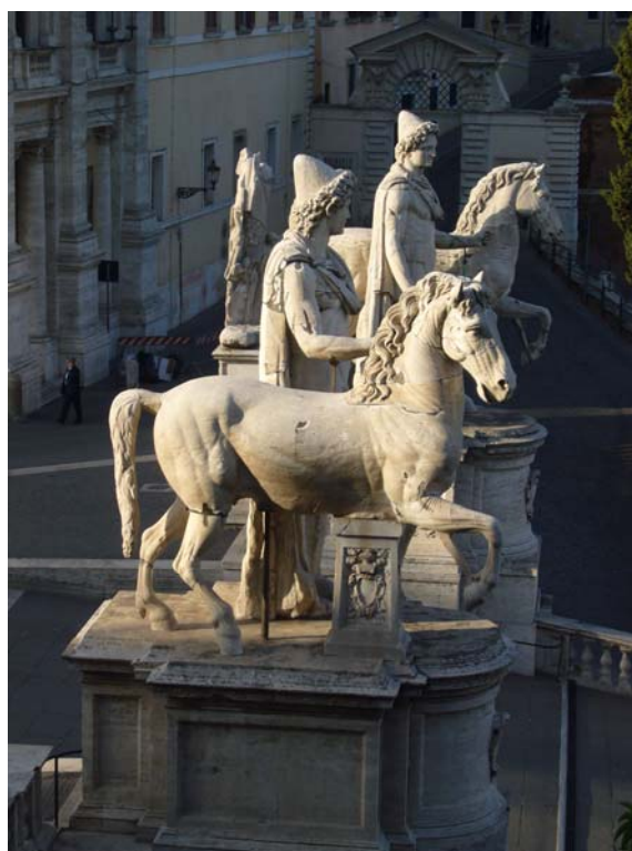
Castor and Pollux, Piazza del Campidoglio, Rome

Rūpa-Pitris (corporeal) the four lower classes of Corporeal Pitris known as Barhishads or Lunar Pitris from the Moon-chain endowed with physical creative fires (but not spiritual-intellectual fires).