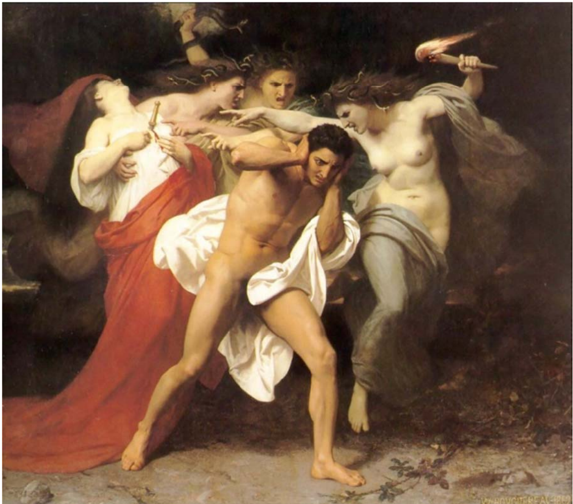
Orestes pursued by the Furies (1862) William-Adolphe Bouguereau, Chrysler Collection, Norfolk, Virginia

I have gone the whole round of Creation: I saw and I spoke! I, a work of God's hand for that purpose, received in my brain And pronounced on the rest of His handwork — returned Him again His creation's approval or censure: I spoke as I saw. I report, as a man may of God's work — all's love, yet all's law. Now I lay down the judgeship He lent me. Each faculty tasked To perceive Him, has gained an abyss, where a dewdrop was asked. Have I knowledge? confounded it shrivels at Wisdom laid bare. Have I forethought? how purblind, how blank, to the Infinite Care! — Robert Browning: Saul , xvii