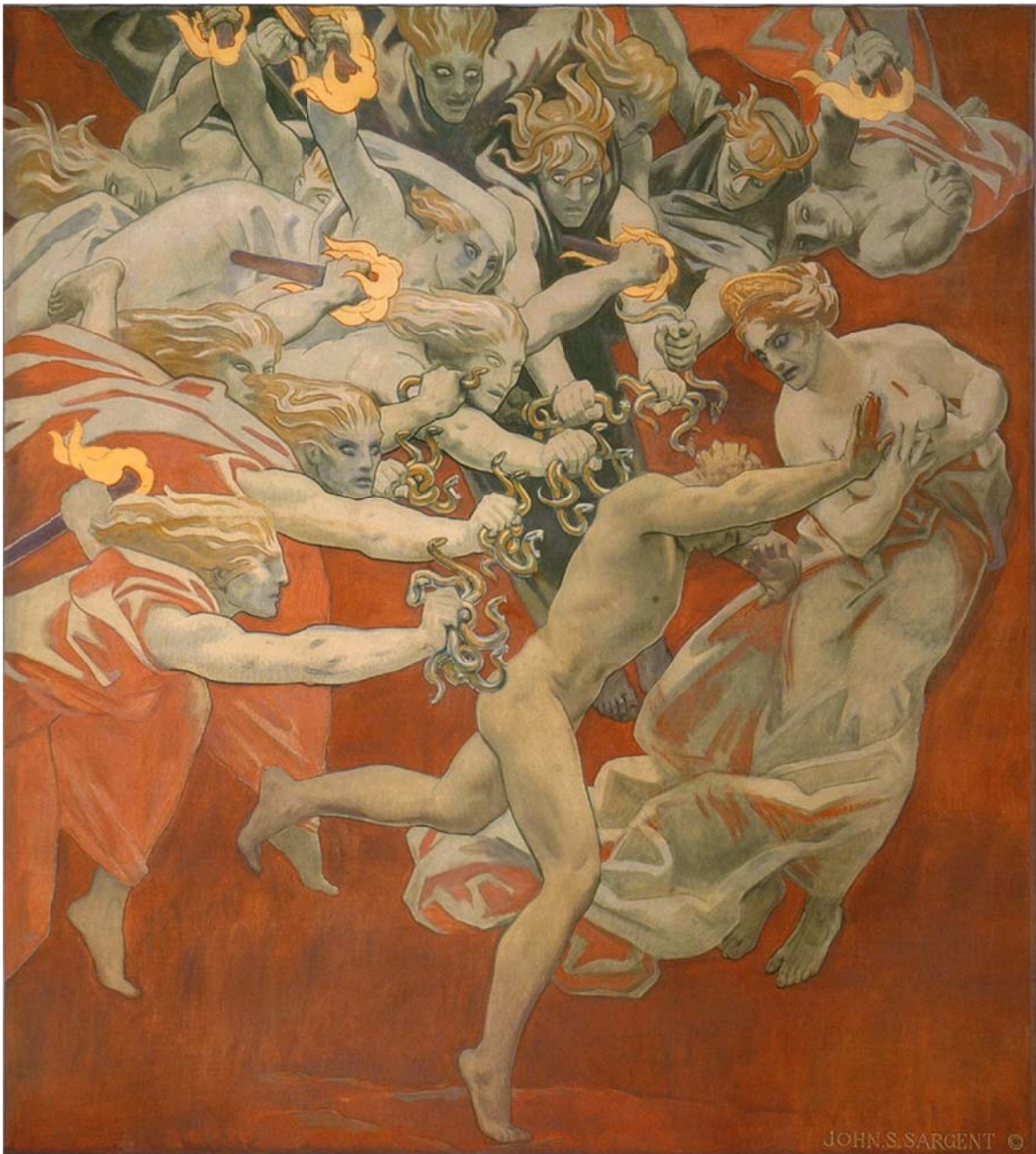
Orestes pursued by the Furies (1921) John Singer Sargent, Boston