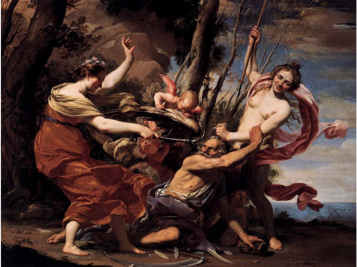
Father Time Overcome by Love, Hope and Beauty (1627) Simon Vouet, Museo del Prado

[Intellect] alone is , and is always, but is never future ; for when the future arrives, it then also is ; nor it is the past . For nothing there has passed away, but all things abide in the present now ; 19