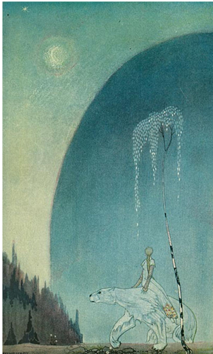
Riding a White Bear in the Moonlight by Kay Nielsen From East of the Sun, West of the Moon , 1914

When the hour of the Solar Pralaya strikes, the Eternal Avyaya (First Logos) will enter into the Seven Rays of the Sun and drink up all the waters of the Universe. Thus fed, the Seven Rays will expand to Seven Suns whose radiance will glow above, below, and everywhere, and will set the World on fire. 12