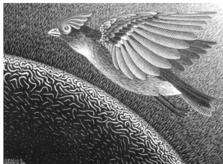
First Day of the Creation by Maurits Cornelis Escher