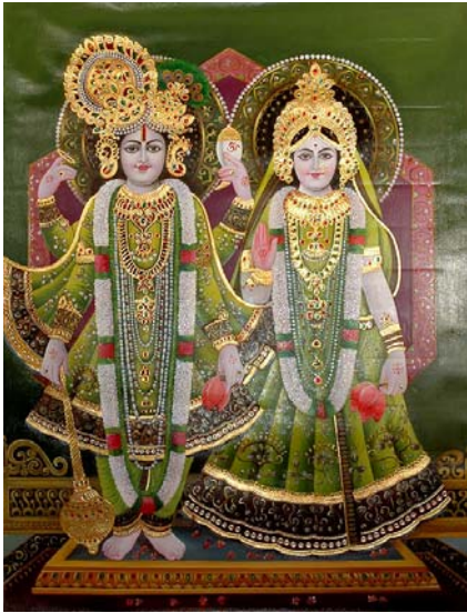
Narayana and Lakshmi

Are the “Great Waters” the same as those on which the Darkness moved?