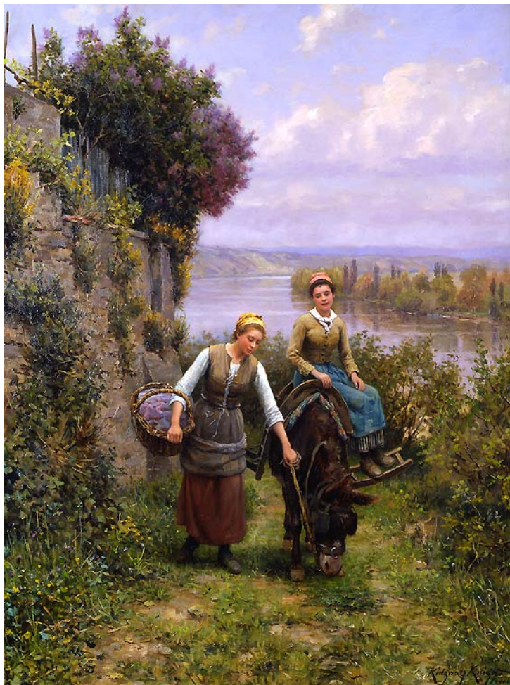
Returning home by Daniel Ridgway Knight

Life itself teaches these lessons; for all such objects of desire are found Dead Sea fruit the moment of attainment. This much we learn from experience. Intuitive perception seizes on the positive truth that satisfaction is attainable only in the infinite; the will makes that conviction an actual fact of consciousness, till at last all desire is centred on the Eternal. 32