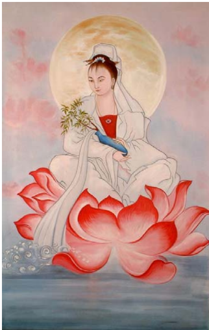
Kwan-Yin, the Buddhist Goddess of Mercy

The Yajña [Compassion – Sacrifice], say the Brahmans, exists from eternity, for it proceeded forth from the Supreme One, the Brahmā-Prajāpati , in whom it lay dormant from "no beginning." It is the key to the TRIVIDYĀ, the thrice sacred science contained in the Rig verses, which teaches the Yajus or sacrificial mysteries.