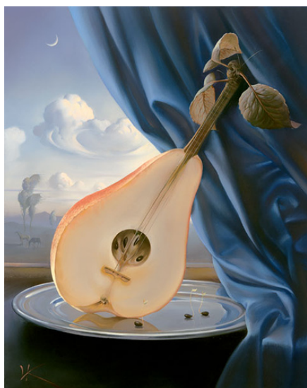
Still life with mandolin by Vladimir Kush

It is the God Sabda Brahmā called also Kala Brahmā Gouri — one of the mystic names for ĀKĀŚA, which gives rise to occult sound — the initiates say. And the ancient Greek mystics, equally with the Western occultists and the adept Brahmans, all agreed in teaching that sound emanated from the Astral Light, or Ākāśa , in its purest essence. The Hindu occultist, or devotee, while practising Raja Yoga, hears the occult sounds as emanating from his own Mūlādhāra — the first of the series of six centres of force in the human body (fed at the inexhaustible source of the seventh or the UNITY, as the sum total of all) and knows that it emanates from there, and from nowhere else. 23