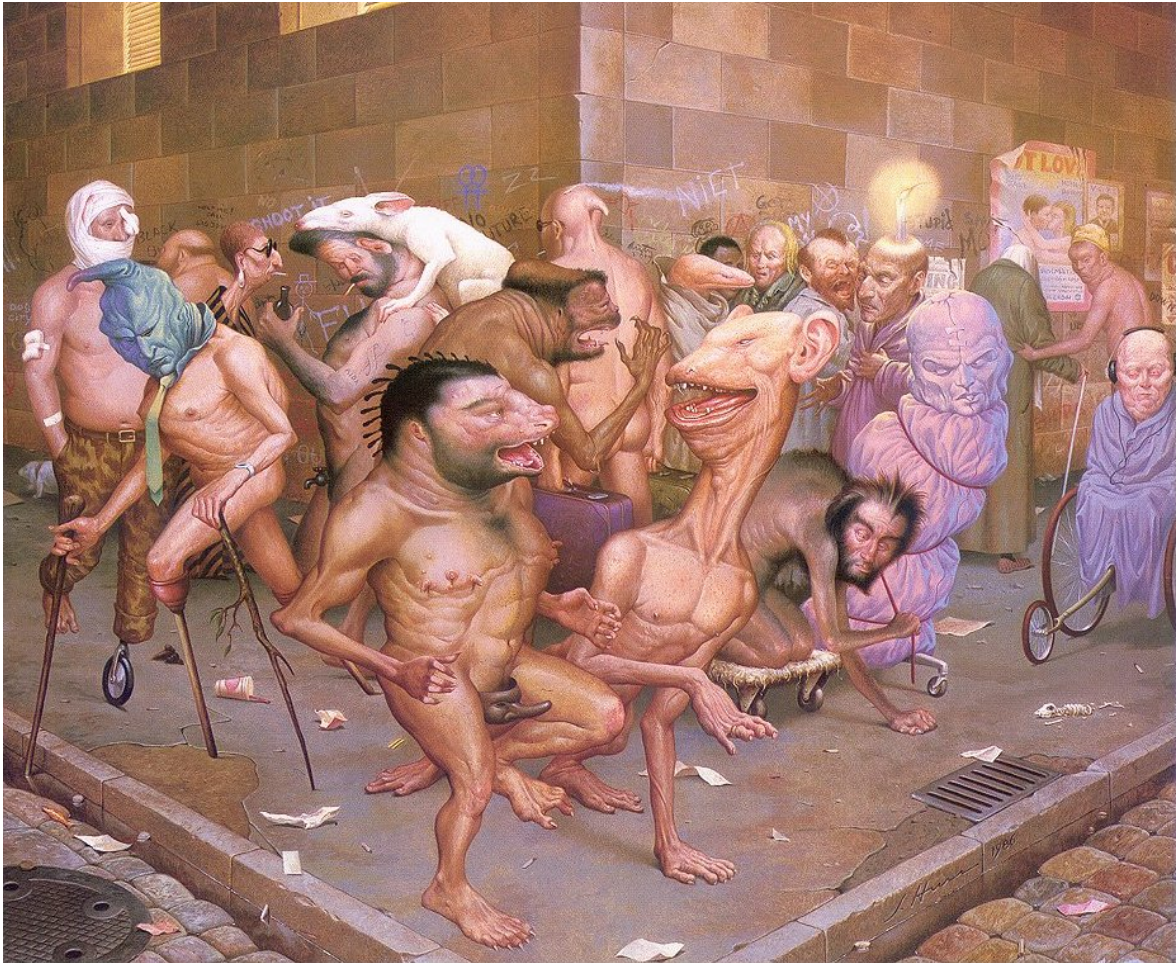
Evening in the City by J Huss

Imagine a given point in space as the primordial one; then with compasses draw a circle around this point; where the beginning and the end unite together, emanation and reabsorption meet. The circle itself is composed of innumerable smaller circles, like the rings of a bracelet, and each of these minor rings forms the belt of the goddess which represents that sphere. As the curve of the arc approaches the ultimate point of the semi-circle — the nadir of the grand cycle — at which is placed our planet by the mystical painter, the face of each successive goddess becomes more dark and hideous than European imagination is able to conceive. . . .