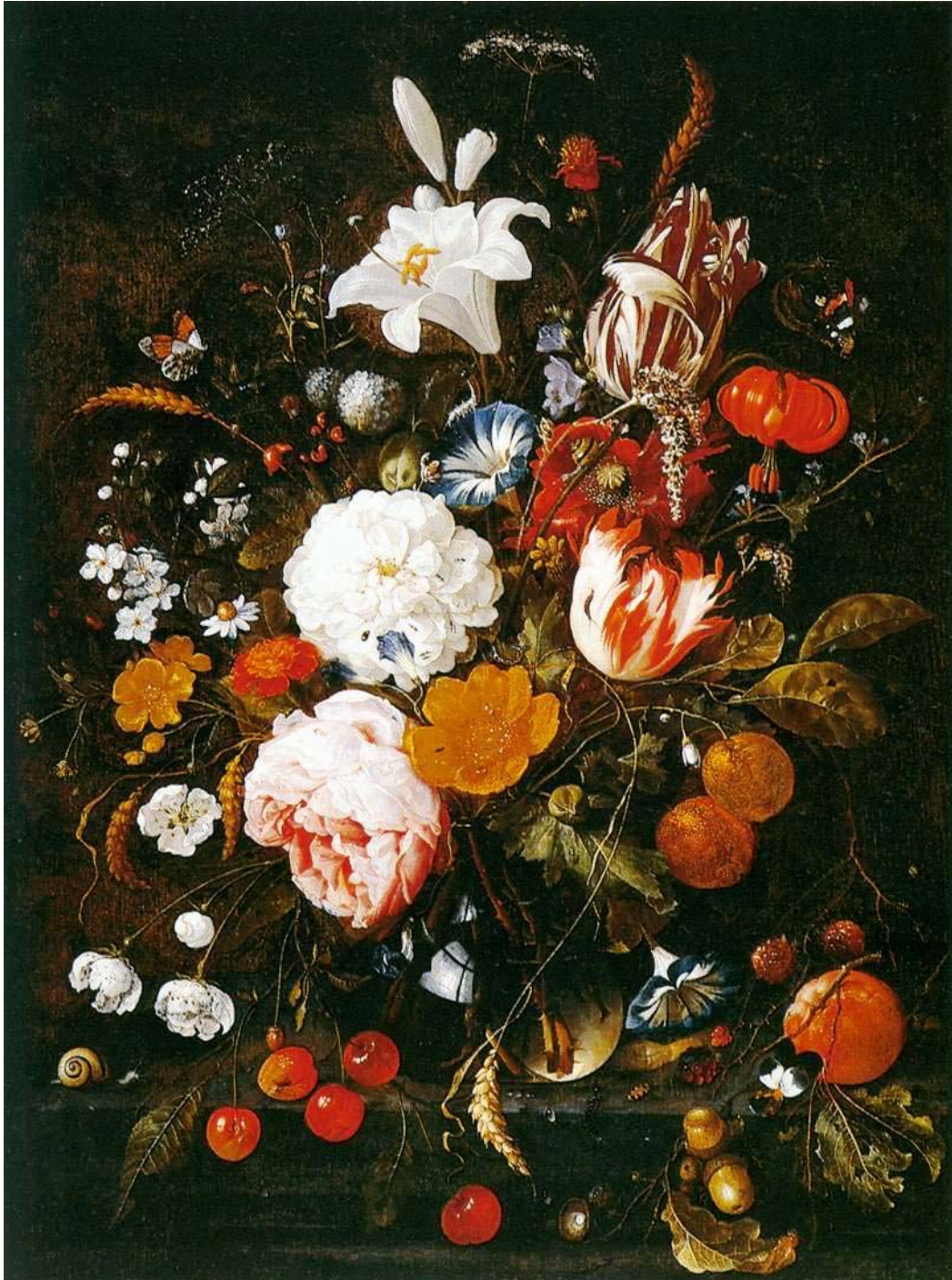
Flowers and Fruit still-life (c 1665) Jan Davidszoon de Heem, Museo Thyssen-Bornemisza

judge otherwise of us than we would have them. 17 Let us then forbear to talk of ourselves, unless the profit that we or our hearers may thence probably reap be considerably great.