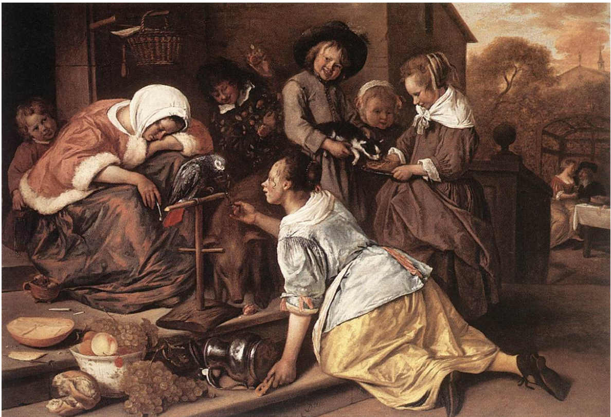
Effects of Intemperance (1663-65) Jan Steen, National Gallery, London

any one? And certainly the mathematics cannot so properly be called (to use the words of Xenocrates) the handles of philosophy, as these passions are of young men, namely, bashfulness, desire, repentance, pleasure, pain, ambition; whereon right reason and the law discreetly laying their salutary hands do thereby effectually and speedily reduce a young man into the right way. Agreeably hereunto the Lacedaemonian instructor of youth was in the right, when he professed that he would bring it to pass that youths under his care should take a pleasure and satisfaction in good and have an abhorrence for evil, than which there cannot be a greater or nobler end of the liberal education of youth proposed or assigned.