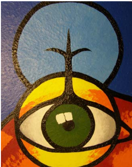
The Window by René Magritte

Veiling the eyes to external vision is the first initiation,