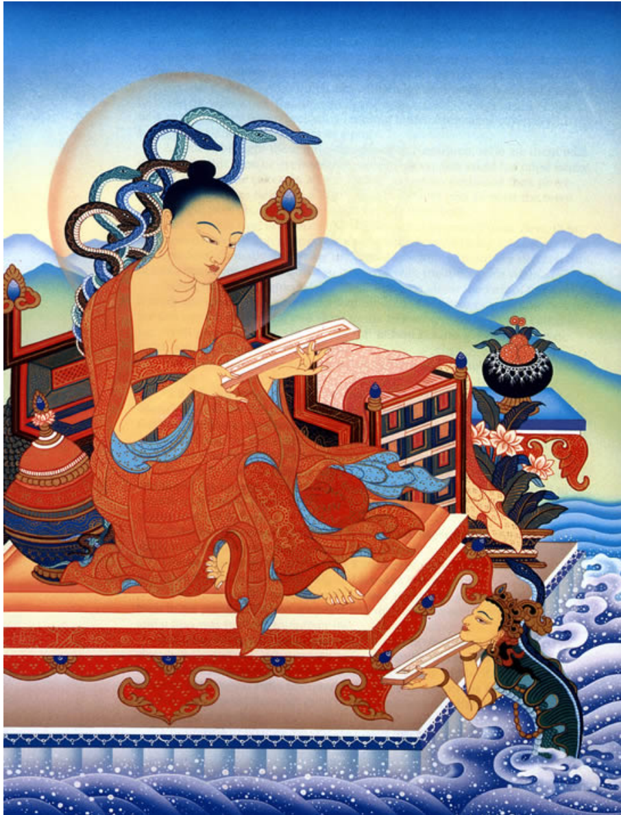
Nagarjuna receiving texts from Nagas