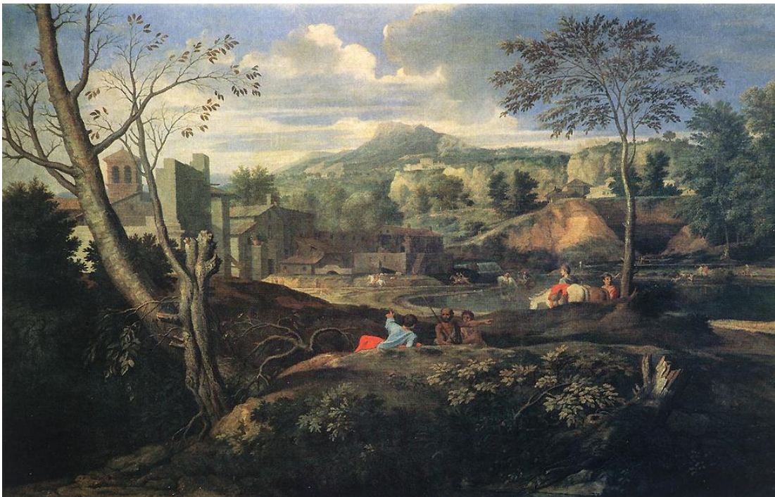
Ideal Landscape (1635) Poussin, Paris

Winter is come: in olive-mills they bruise The Sicyonian berry; acorn-cheered The swine troop homeward; woods their arbutus yield; So, various fruit sheds Autumn, and high up On sunny rocks the mellowing vintage bakes. Meanwhile about his lips sweet children cling; His chaste house keeps its purity; his kine Drop milky udders, and on the lush green grass Fat kids are striving, horn to butting horn. Himself keeps holy days; stretched o'er the sward, Where round the fire his comrades crown the bowl, He pours libation, and thy name invokes, Lenæus, and for the herdsmen on an elm Sets up a mark for the swift javelin; they Strip their tough bodies for the rustic sport. Such life of yore the ancient Sabines led, Such Remus and his brother: Etruria thus, Doubt not, to greatness grew, and Rome became The fair world's fairest, and with circling wall Clasped to her single breast the sevenfold hills. Ay, ere the reign of Dicitæ's king, ere men, Waxed godless, banqueted on slaughtered bulls, Such life on earth did golden Saturn lead. Nor ear of man had heard the war-trump's blast, Nor clang of sword on stubborn anvil set. But lo! a boundless space we have travelled o'er; 'Tis time our steaming horses to unyoke.