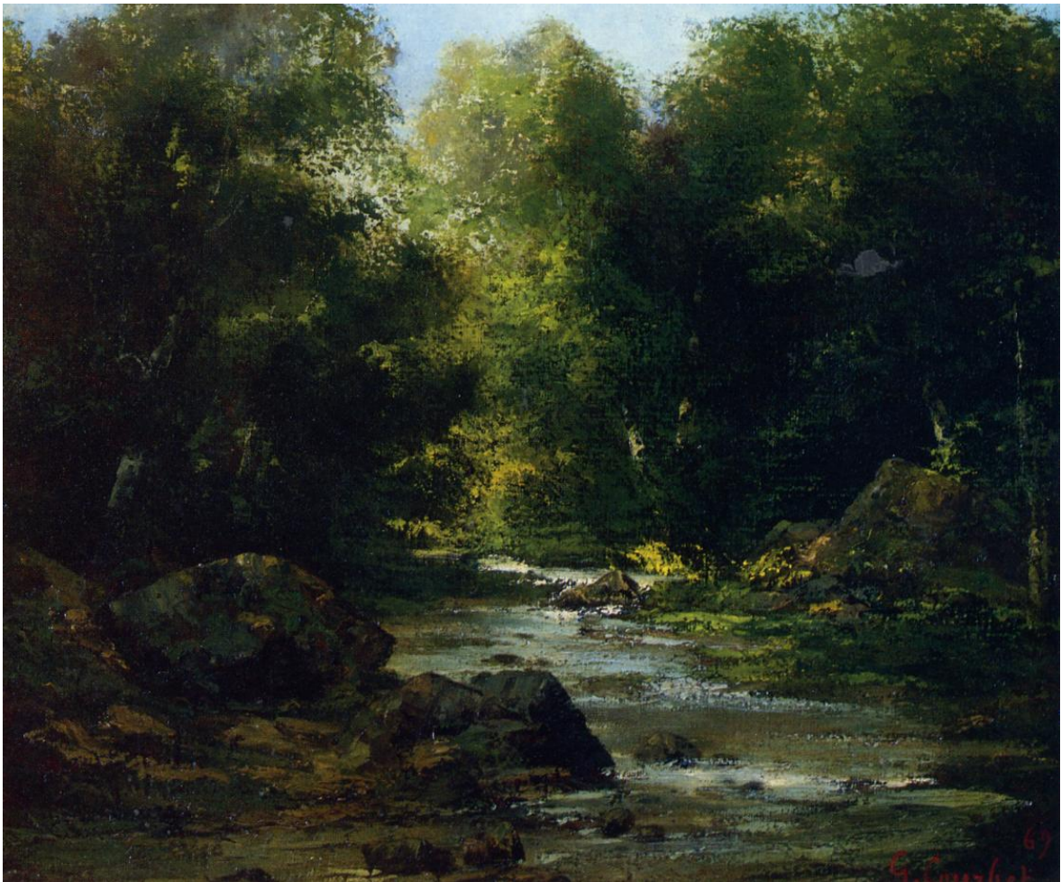
River Landscape by Gustave Courbet

Where wars abound so many, and myriad-faced Is crime; where no meet honour hath the plough; The fields, their husbandmen led far away, Rot in neglect, and curved pruning-hooks Into the sword's stiff blade are fused and forged. Euphrates here, here Germany new strife Is stirring; neighbouring cities are in arms, The laws that bound them snapt; and godless war Rages through all the universe; as when The four-horse chariots from the barriers poured Still quicken o'er the course, and, idly now Grasping the reins, the driver by his team Is onward borne, nor heeds the car his curb.