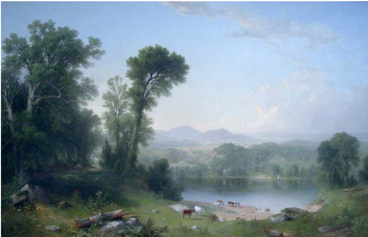
Pastoral Landscape (1861) by Asher Brown Durand

From The Georgics of Virgil (2 nd ed.). London: Kegan Paul, Trench, Trübner & Co. Ltd, 1891