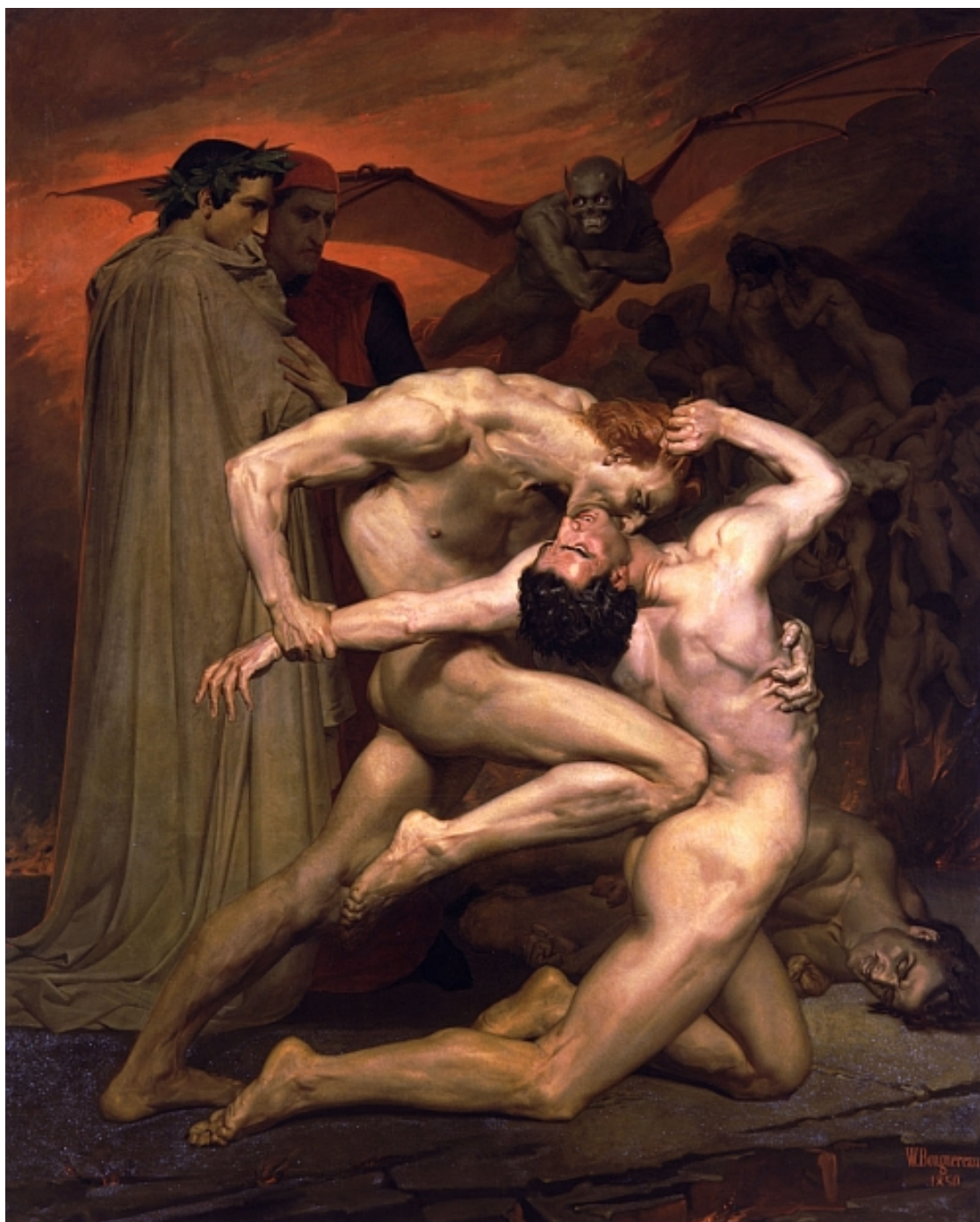
Virgil and Dante in Hell (1850) William-Adolphe Bouguereau

tics, who would exchange all the tortures of conscious life, all the evils of a responsible existence, for the unconscious perfection of a passive (objectively) incorporeal being, or even the universal static inertia personified in Brahmā during his “night’s” rest. 41