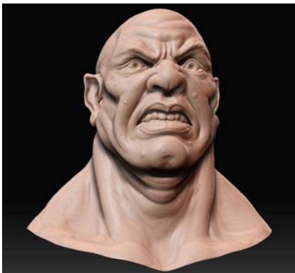
Angry Man by Duylinh Nguyen

When Parāśara, whose father was devoured by a Rākshasa, was preparing himself to destroy (magically) the whole race, his grandsire, Vasishtha, says a few extremely suggestive words to him. He shows the irate Sage, on his own confession, that there is Evil and Karma , but no “evil spirits.”