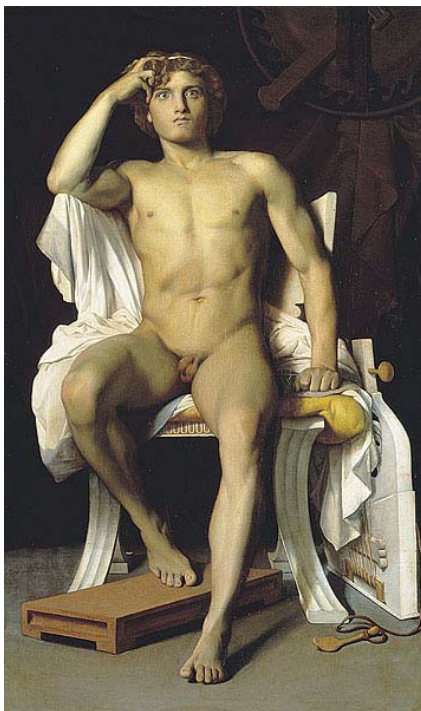
Wrath of Achilles (1847) Léon Benouville

Plato suggests that though pain, fear, anger, and other feelings are given to men by necessity, “if they conquered these they would live righteously, and if they were conquered by them, unrighteously.”