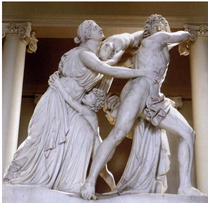
Fury of Athamas (1790-1794) John Flaxman, Ickworth National Trust

Every sentence of Pythagoras, like most of the ancient maxims, has a dual signification; and, while it had an occult physical meaning, expressed literally in its words, it embodied a moral precept, which is explained by Iamblichus in his Life of Pythagoras . This “Dig not fire with a sword,” is the ninth symbol in the Protreptics of this Neo-platonist. “This symbol,” he says, “exhorts to prudence.” It shows “the propriety of not opposing sharp words to a man full of fire and wrath, nor contending with him. For frequently by words you will agitate and disturb an ignorant man, and you will yourself suffer things dreadful and unpleasant. Heraclitus also testifies to the truth of this symbol. For, he says, ‘It is difficult to fight with anger; for whatever is necessary to be done redeems the soul.’ And this he says truly. For many, by gratifying anger, have changed the condition of their soul, and have made death preferable to life. But by governing the tongue and being quiet, friendship is produced from strife, the fire of anger being extinguished, and you yourself will not appear to be destitute of intellect.” 14