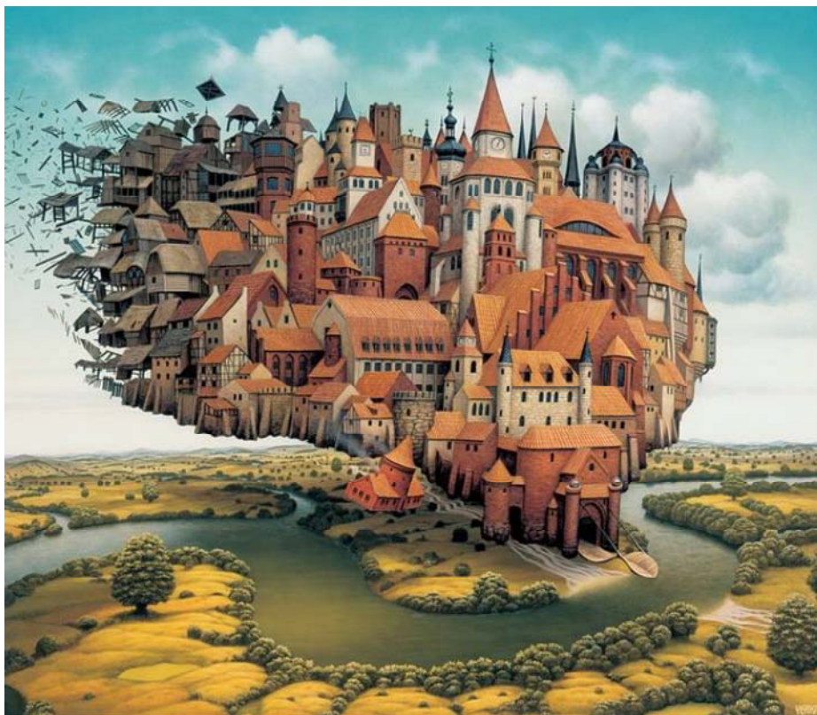
[River Island Dreams] by Jacek Yerka

W.Q.J. — The general proportion as I have always known of it between earth life and Devachan is that between 70 years of life and 1500 years in Devachan. Further it is known that many persons emerge from the Devachanic state very soon after entering it. A reflection on the fact that the years of our life are full of thoughts attached in vast numbers to every single act will show why Devachan is so much longer than earth-life. The disproportion between the act done and the thoughts intimately belonging to it is enormous, and, compared with Devachan as related to earth-life, it is vast. In Devachan these thoughts, which could never find but the very smallest fraction of expression in this life, must exhaust and can be exhausted nowhere else. This is what is required, not by evolution, but by thought itself. And those who have but little aspiration here, who indulge in act more than thought, lay but little basis for Devachan, and hence emerge from it sooner than others. 49