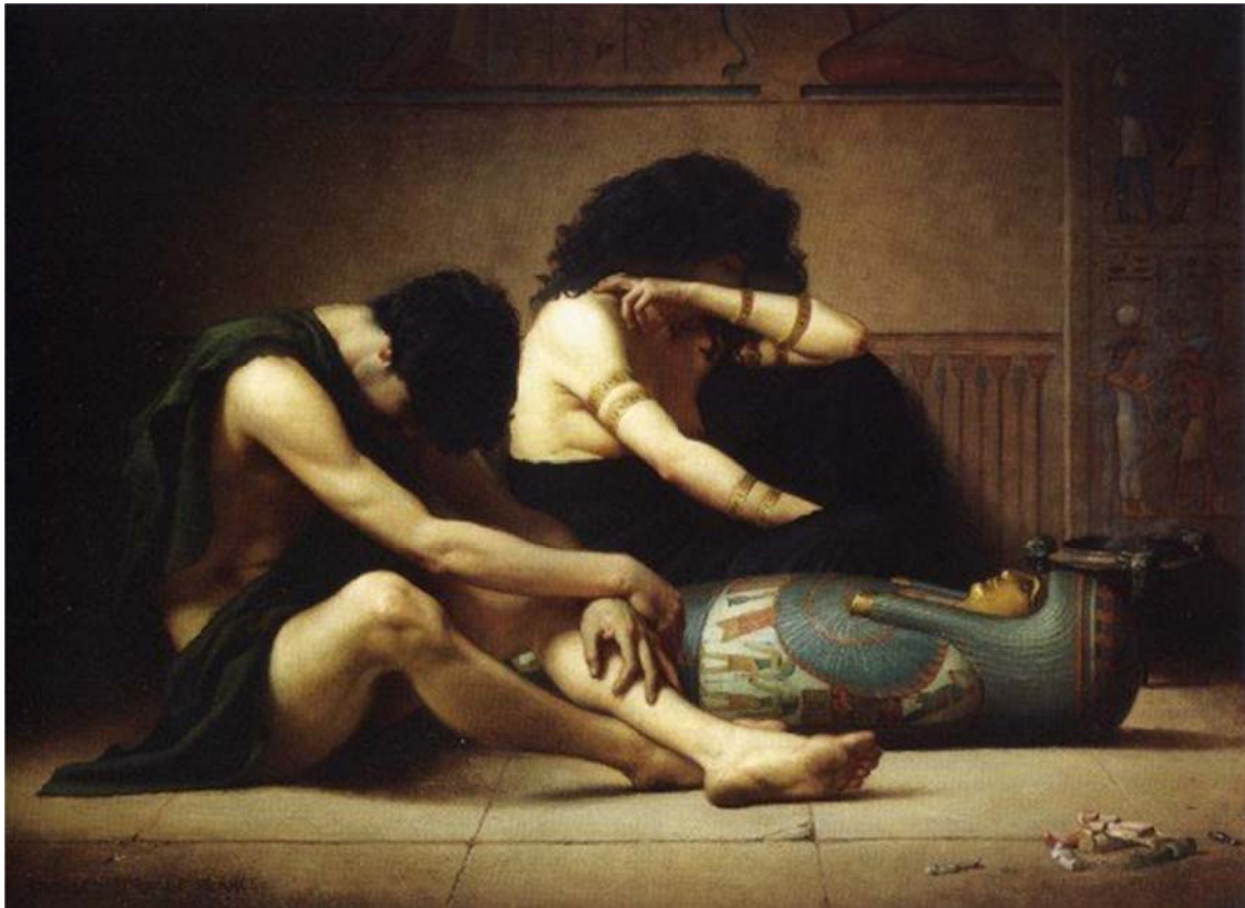
Lamentations over the death of the first born (1877) Charles Sprague Pearce

Away, then, with those follies, which are little better than the old women's dreams, such as that it is miserable to die before our time. What time do you mean? That of nature? But she has only lent you life, as she might lend you money, without fixing any certain time for its repayment. Have you any grounds of complaint, then, that she recalls it at her pleasure? for you received it on these terms. They that complain thus allow that if a young child dies, the survivors ought to bear his loss with equanimity; that if an infant in the cradle dies, they ought not even to utter a complaint; and yet nature has been more severe with them in demanding back what she gave. They answer by saying that such have not tasted the sweets of life; while the other had begun to conceive hopes of great happiness, and, indeed, had begun to realize them. Men judge better in other things, and allow a part to be preferable to none. Why do they not admit the same estimate in life? 31