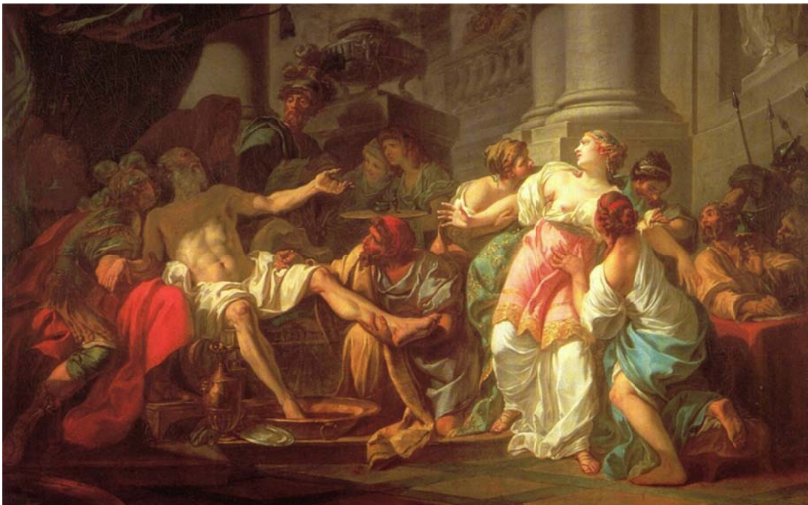
Death of Seneca (1773) Jacques-Louis David

The Animal Soul, or Lower Manas, that shadow of the Divine Ego which separates from it to inform the personality (the details of which process will now be given), cannot by any possible means escape death at Kāma-Loka, at any rate that portion of this reflection which remains as a terrestrial residue and cannot be impressed on the Ego. Thus the chief and most important secret with regard to that “second death,” in the esoteric teaching, was and is to this day the terrible possibility of the death of the Soul, that is, its severance from the Ego on earth during a person’s lifetime. This is a real death (though with chances of resurrection), which shows no traces in a person and yet leaves him morally a living corpse. [Prior to 1890 the latter teaching has been kept secret.] 39