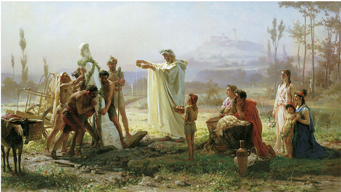
Consecration of the herm by Fyodor Bronnikov