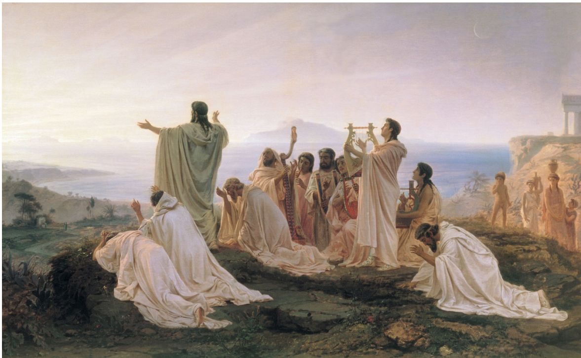
Pythagoreans celebrate sunrise (1869) Fyodor Bronnikov