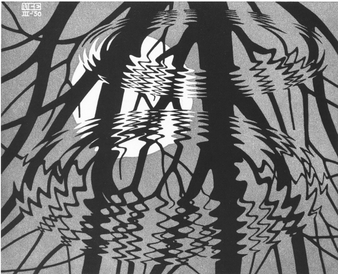
Rippled Surface by Maurits Cornelis Escher